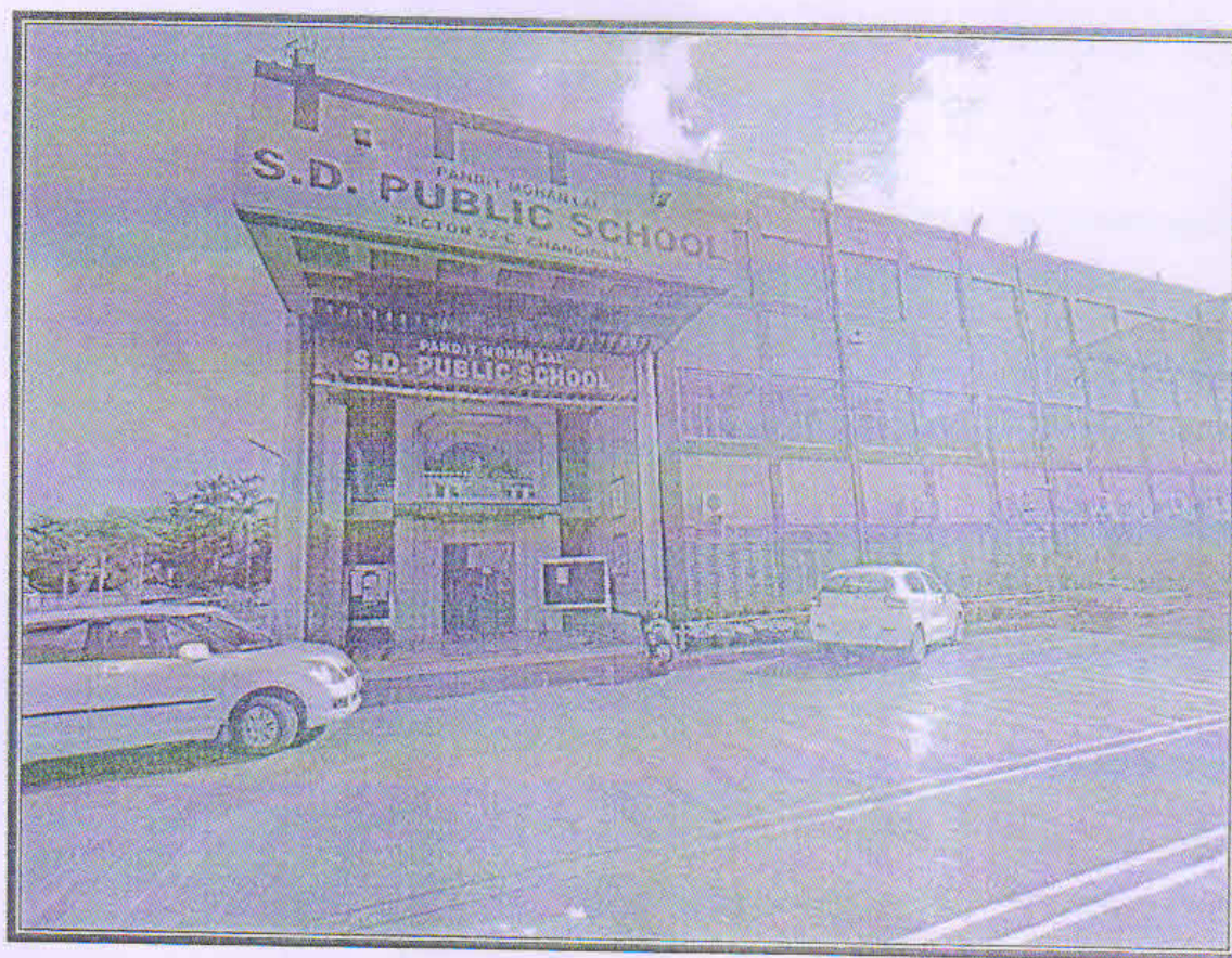
FRONT ELEVATION OF THE BUILDING

[Signature] Principal Pandit Mohan Lal Sardar Dharma Public School Sector 32-C, Chandigarh-160030