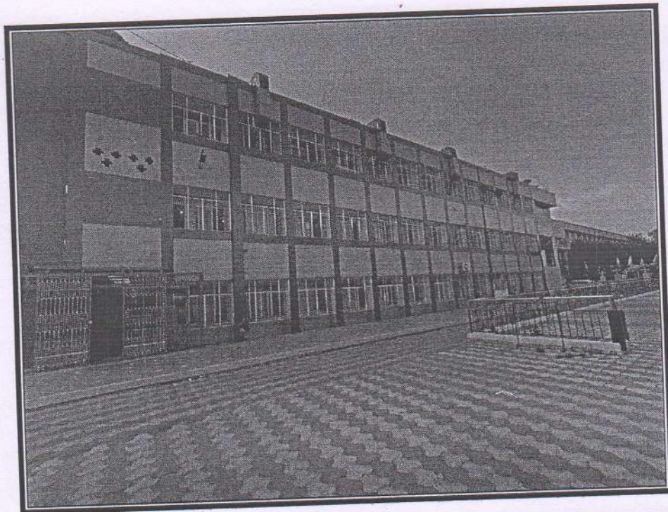
PHOTOGRAPH FROM ASSEMBLY GROUND SIDE OF THE BUILDING